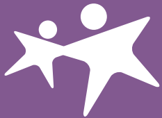
A Caring Adult

HIGH FIVE holds true to the following five Principles of healthy child development that the research indicates are essential for quality programs.